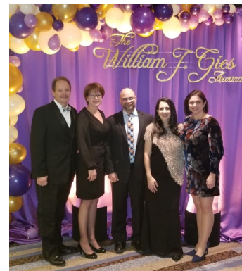
ADEA William Gies Gala