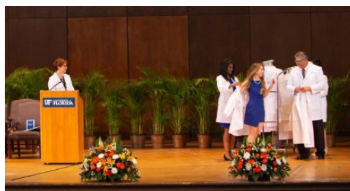
White Coat Ceremony