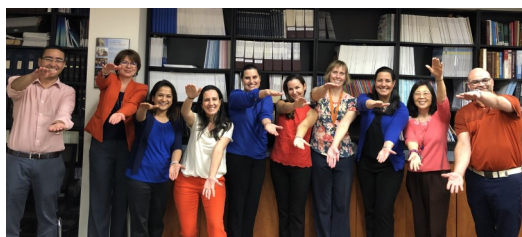
Support on Gator Day in Capitol Hill