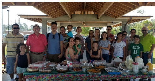
3rd Annual Operative Spring Picnic