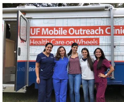
UF Health Mobile Outreach Clinic