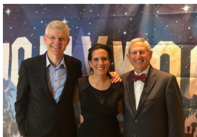
2019 Bicuspid Ball