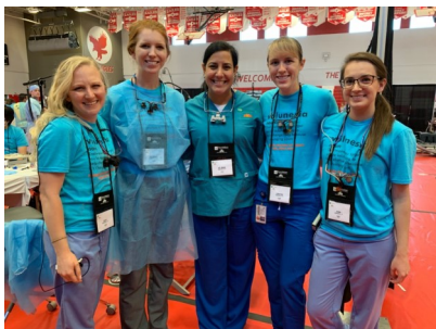
Mission of Mercy (MOM)