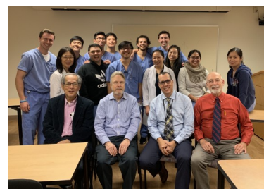
Lunar New Year Potluck