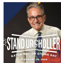
Gator Nation Giving Day

and AAWD, WeCare, EACN, Super Sealant Saturday, GCM, Migrant Clinic, Boards and Spring Synergy.