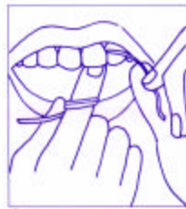
Using floss between upper teeth.