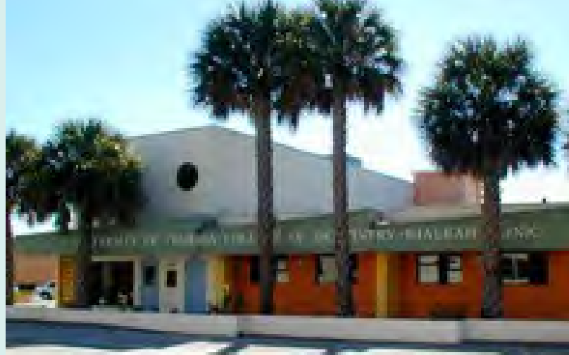
Hialeah Dental Center

free oral health screening courtesy of faculty and staff in the department who work with second year DMD students. This event also provides the first clinical experience for our college's DMD students.