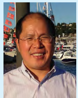
John Zhang Orthodontics February