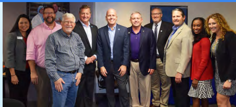
Members from the Florida Dental Association's Board of Trustees and House of Delegates toured the college on Friday, December 2.

Each year the college's practice plan is audited by an independent firm that reviews its financial statements including revenues, expenditures and other items. Purvis, Gray & Company completed the FY16 audit and presented it to the Audit Committee on September 28. As I detailed at the December 1st Faculty Associates Annual Meeting, we received, once again, a clean audit report. I would like