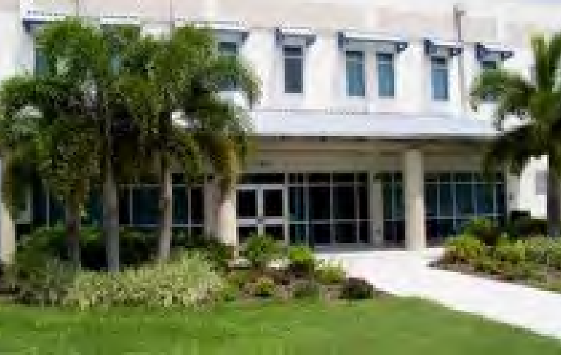
St. Petersburg Dental Center